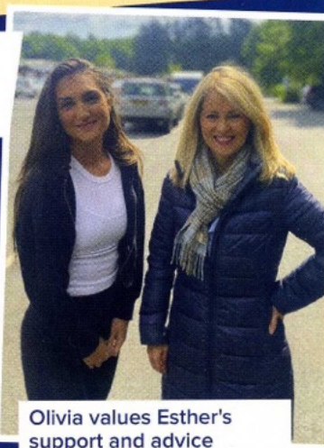
Olivia values Esther's support and advice