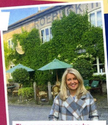
The company runs pubs across Cheshire which are a vital part of village life